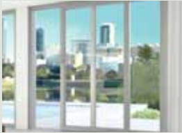
Windows and Doors

At REHAU continues innovation to add value to customers and partners with sophisticated products, solutions and services is a enduring activity.