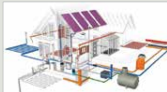
REHAU Range of Products for Construction