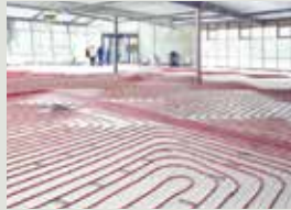
Radiant Heating and Cooling