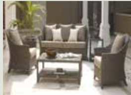
Indoor and Outdoor furniture