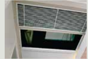
AC Trap Door