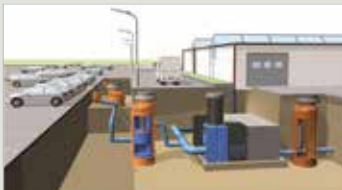
Water Harvesting System