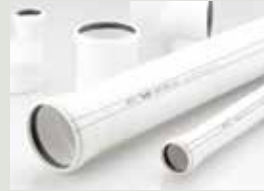
Plumbing & Piping System